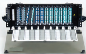
Uniprise® ReadyPATCH™ Pre-Terminated Fiber Solution