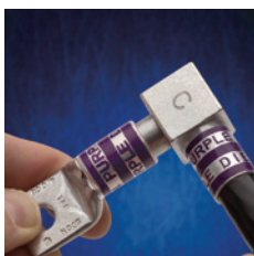
Color-Keyed® KUBE® Flag, Tee and Cross Connectors