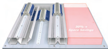
PANELMAX™ DIN Rail Wiring Duct